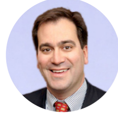
Prof. Dr. Chad A. Mirkin Northwestern University Evanston, Illinois, USA